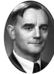
Cecil Frank Powell