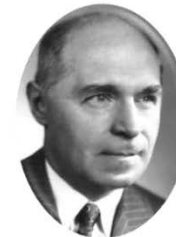
Hermann Joseph Muller