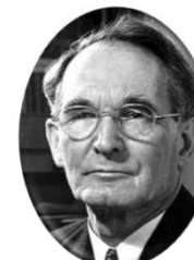
Percy Williams Bridgman