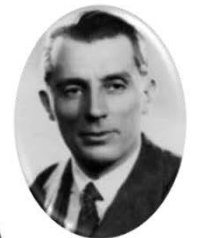
Jean Frédéric Joliot-Curie