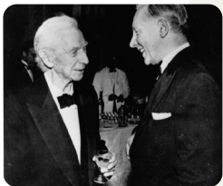
Joseph Rotblat (right) with Bertrand Russell

Pugwash was born on 9 July 1955 when Bertrand Russell released the Russell-Einstein Manifesto, calling on world leaders to "learn to think in a new way". Joseph Rotblat chaired the launch and convened the 1957 conference in Pugwash, Nova Scotia that set up the British Advisory Committee for Pugwash. British Pugwash was formed in 1963, with Sir Neville Mott as the first Chair. Other scientists, including Cecil Powell, Rudolf Peierls and Dorothy Hodgkin, have guided British Pugwash over the years.