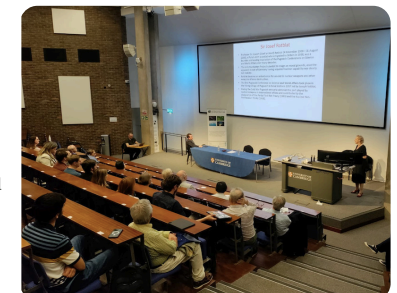
Prof Dame Athene Donald gives a British Pugwash lecture at Cambridge University in May 2024.