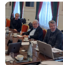
Members of International Pugwash attend a meeting to discuss European nuclear issues at Bristol in January 2023.

Please see overleaf for the application form.