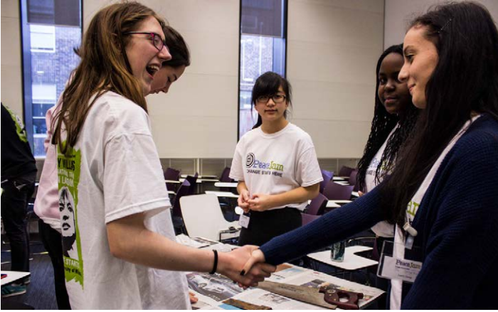
Tools for Africa workshop 2015

universities of Bradford and Cardiff, and will shortly be training students at the University of York who will be coming down to mentor at next year's conference.