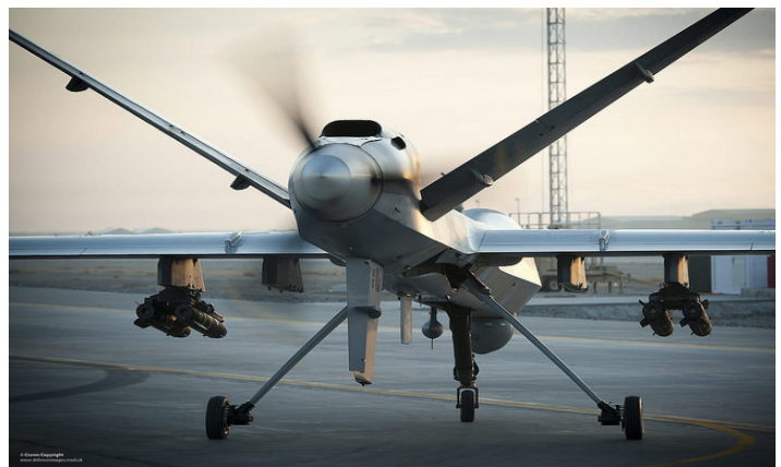
A Royal Air Force Reaper RPAS (Remotely Piloted Air System) at Kandahar Airfield in Afghanistan.

A report on the deliberations was delivered to the annual CCW meeting in November 2015, when nations agreed to hold another meeting in April 2016. An encouraging aspect in the 2016 mandate is a statement that the April meeting 'may agree by consensus on recommendations for further work for consideration by the 2016 Fifth Review Conference', perhaps implying the experts group is working toward a concrete outcome, and that work will continue after the Review Conference. More information at: http://www.stopkillerrobots.org