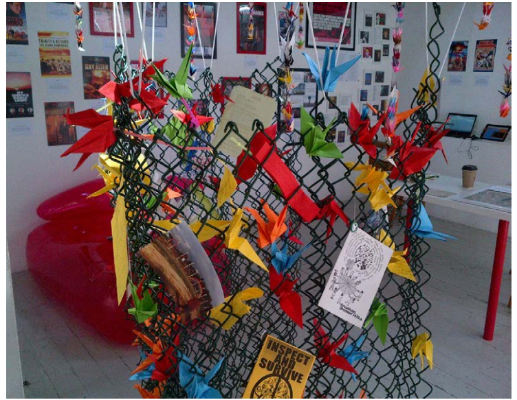
At the 2015 Edinburgh Fringe WMDA put on an interactive exhibition, 'Popular Culture and the Bomb', for the 70th anniversaries of the bombings of Hiroshima and Nagasaki, featuring iconic pictures, music, films, books, anime, computer games and artefacts and a donated piece of wire from Greenham Common that participants added to during the week. The exhibition has since been on display in Bristol.

Later in the year, the Ambassadors, with support, have succeeded in raising £3,000 through a crowd funding campaign to organise a 'Nuke FilmFest', a series of film screenings around the country, raising awareness about nuclear weapons. The headline London event will take place on Friday 1 April 2016, and will be the biggest Ambassador event yet. http://www.wmdawareness.org.uk/