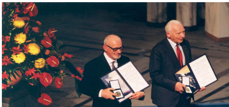
In 2015 we celebrated the 60th anniversary of the publication of the Russell-Einstein Manifesto and the 20th anniversary of the Roblat/Pugwash Nobel peace prize, reminders that many of the concerns that formed the basis of the Pugwash movement are still with us.